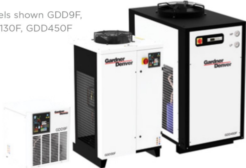
Models shown GDD9F, GDD130F, GDD450F