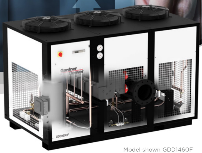
Model shown GDD1460F